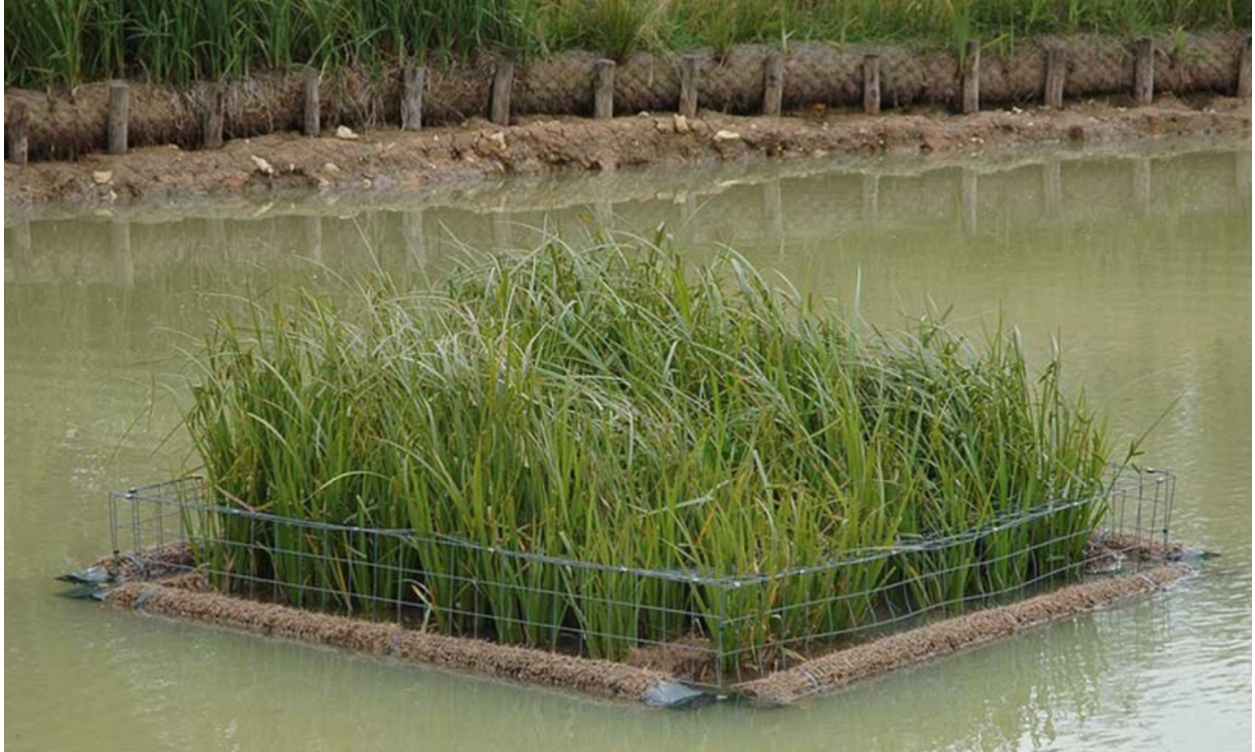
Typical Floating Island.